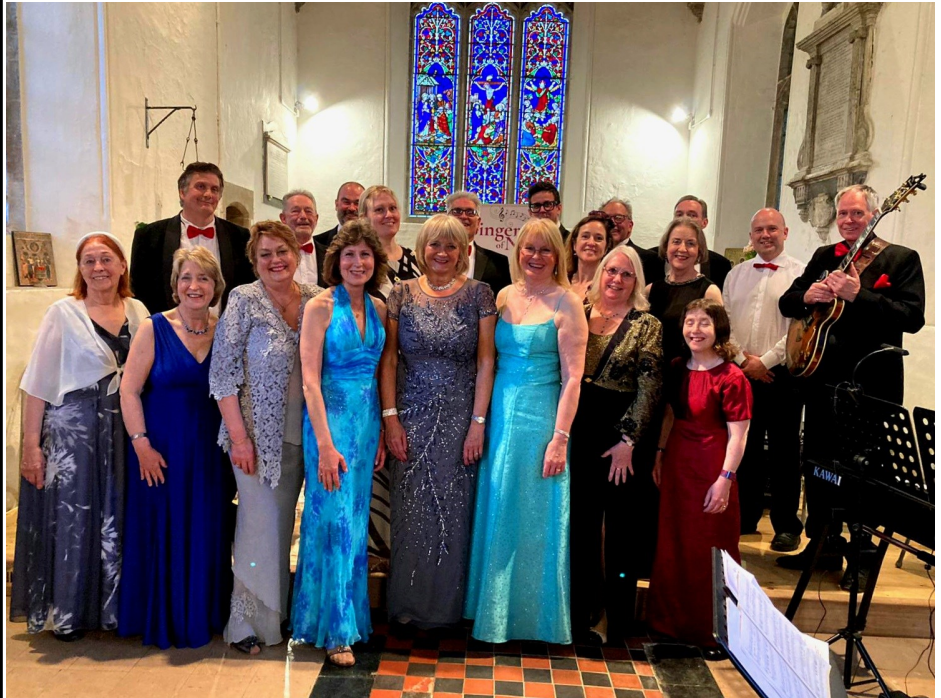
'SINGERS OF NOTE' AFTER THEIR SUCESSFUL CONCERT IN ST MARGARET'S CHURCH