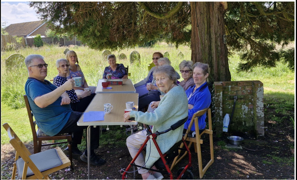
A THURSDAY COFFEE MORNING IN THE SUN