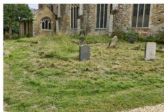
Local villagers working hard to cut the very long grass in the churchyard. As you can see, progress is being made.