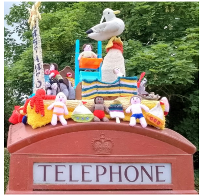
The Clenchwarton Knitters think Summer has arrived.